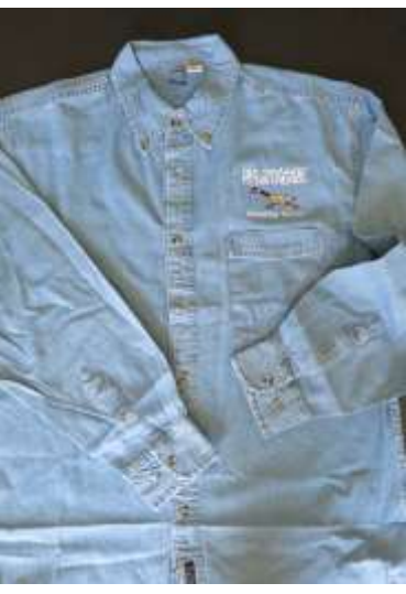
Medium blue, 100% cotton long sleeved denim shirt. No back pleat. (S to 4 XL) Thank you gift for donation of $125.00

50/50 cotton/polyester ash gray t-shirt. (S to 4 XL) Comes in short sleeves and long sleeves. Short sleeve t-shirt for donation of $40. Long sleeve t-shirt for donation of $60.