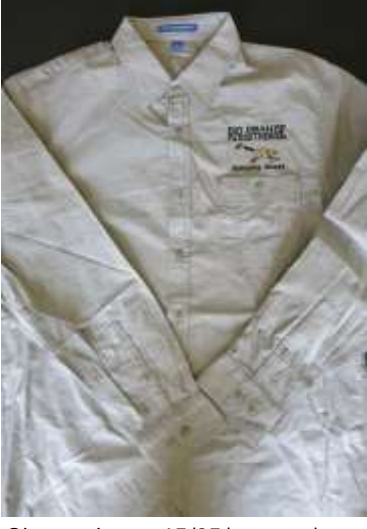
Charcoal gray 65/35/ cotton/ polyester soft texture classic chambray long sleeved shirt. (S to 4 XL). Thank you gift for donation of $125.00

50/50 cotton/polyester ash gray t-shirt. (S to 4 XL) Comes in short sleeves and long sleeves. Short sleeve t-shirt for donation of $40. Long sleeve t-shirt for donation of $60.