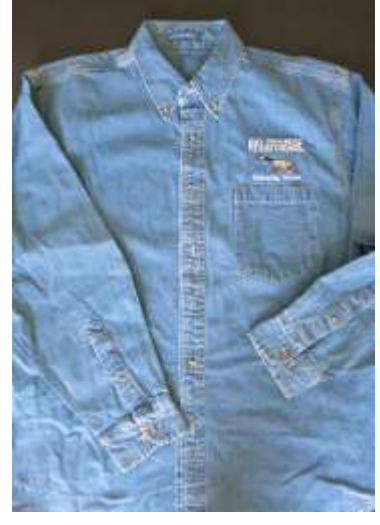
Heavy weight denim shirt made of dark blue, stonewashed fabric. No back pleat. (S to 4 XL) Thank you gift for donation of $150.00

Two types of gifts are available, shirts and decorative plates. "The long sleeved denim and chambray shirts are high quality and have never been offered for sale in our gift shop. The plates were made for Jackson Hardware in Durango. They are relatively rare and difficult to acquire," said Denise. "Either can be yours for a donation to the Galloping Goose Historical Society!" Fill out the donation form and send it in today, for the best choice of thank you gifts.