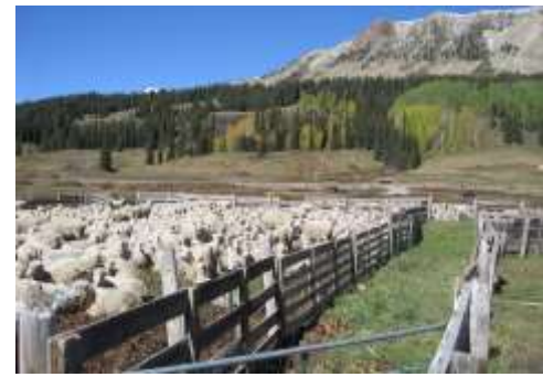
Looking down the chute in the stock pens at Lizard Head Pass. This photo, taken in October 2013, shows sheep waiting for transport by truck. During the RGS days, sheep would be transported in stock cars.

Livestock Drives to Dolores Sheep, cattle and hogs are driven up to 30 miles to be loaded in stock cars