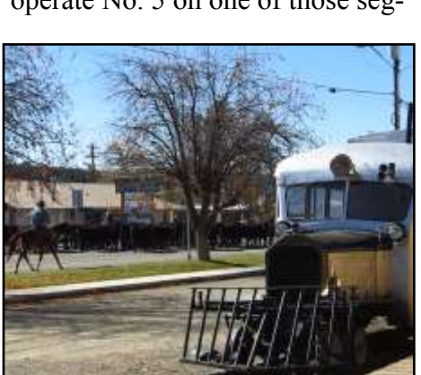
Cattle drive past GGHS museum on November 11th

Each day, the scheduled route was divided into four segments, and each trainee was assigned to operate No. 5 on one of those seg-