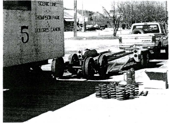
New rear wheels ready for installation

When Galloping Goose No. 5 was being restored in 1997/1998, it was decided that it would be rebuilt to operating condition, not just for static display. That project came to life with its return to the rails on the Cumbres & Toltec Scenic Railroad in late May, 1998.