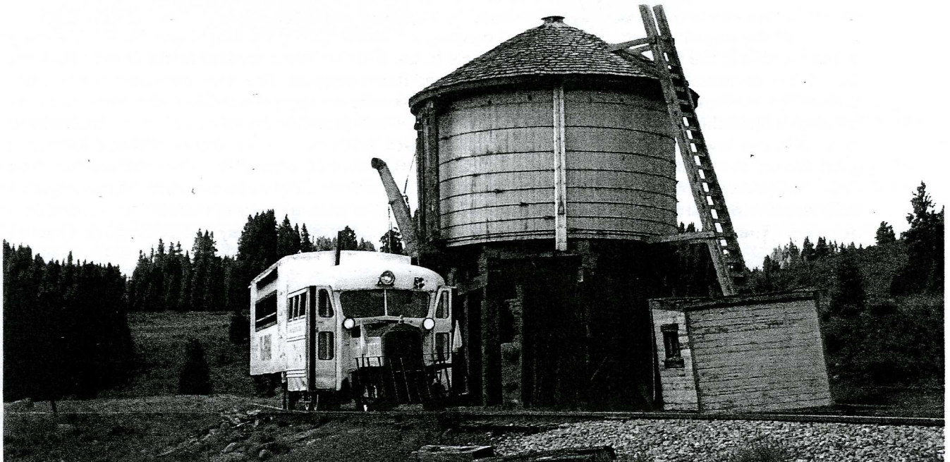
Galloping Goose No.5 slowly passes the Los Pinos Tank (MP 325.5) performing a photo run-by for its passengers on The Cumbres & Toltec Scenic Railroad – June, 2006. (What looks like grainy spots in the sky are Cliff Swallows that nest in the shade of the tank.)