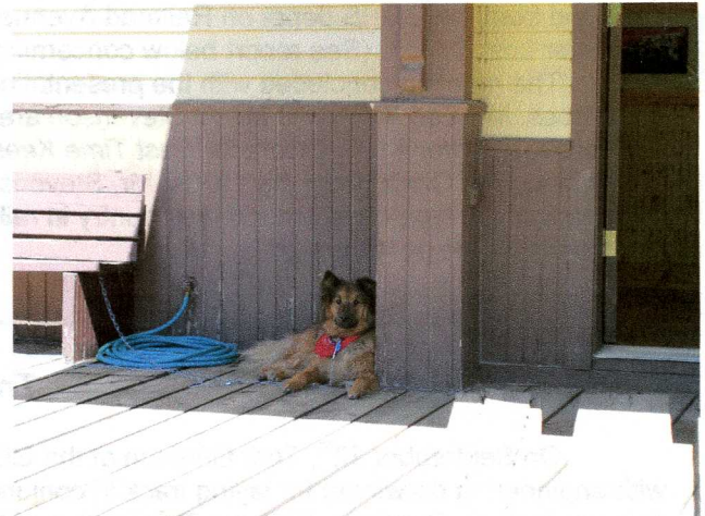
Kodiak the depot dog supervises the unloading.