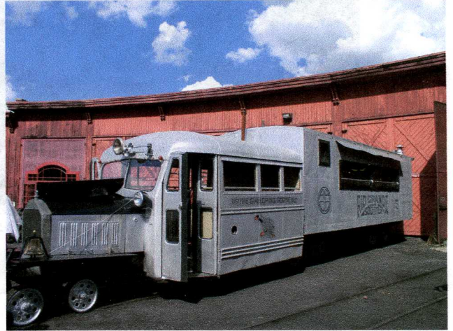
Goose No. 5 takes the night off at the D&S roundhouse.