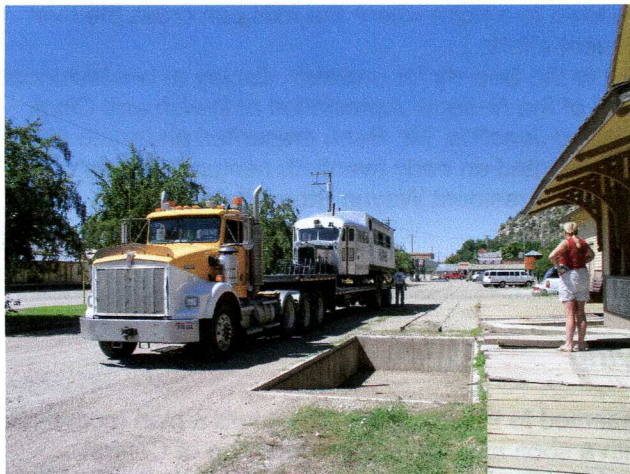
Return to Dolores Depot on Nielsons/Skanska's truck.