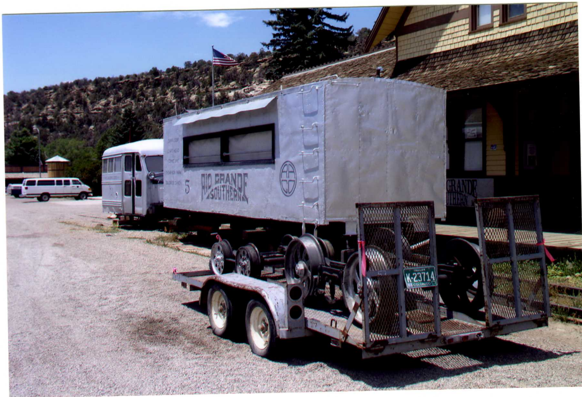
July 2004 - Refurbished Trucks (Pilot & Trailing) Delivered for Reinstallation